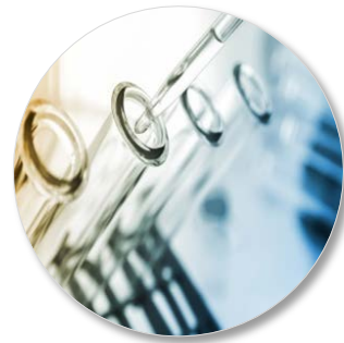
EC-Rep services for In Vitro Diagnostics