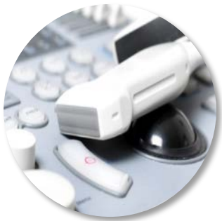
EC-Rep services for Medical Devices

We would like to present you our Authorized Representation Services at CMEF 2019 – the China International Medical Equipment Fair. Visit us at Hall 5.1, Stand K42 .