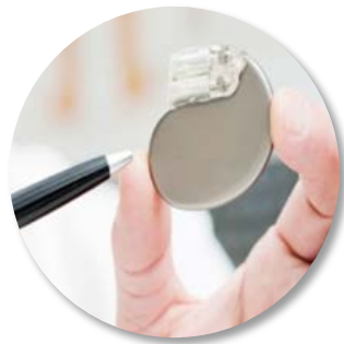
EC-Rep services for Active Implantable Medical Devices