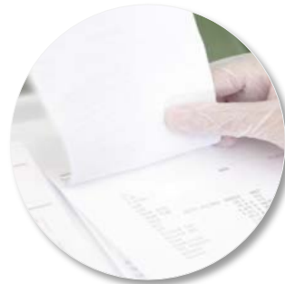
Sponsor representation Clinical Studies